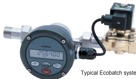
Typical Ecobatch system