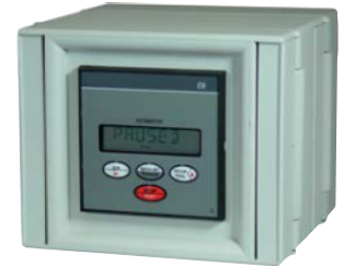
DIN mount field enclosure