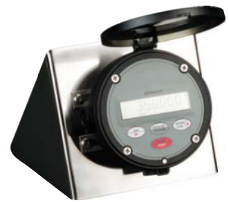
wall - surface mount