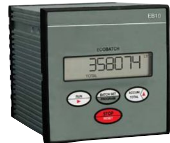
DIN panel mount