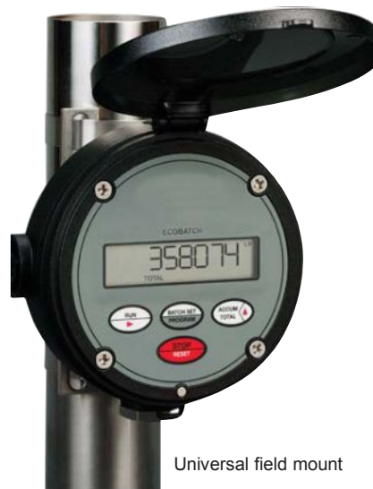
Universal field mount